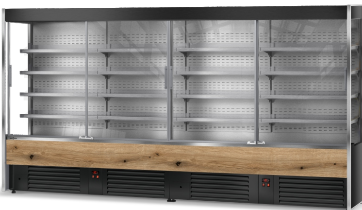
Line of 2 glazed multideck refrigerated displays RCh-SR/196

upper and lower front: RAL 9003 Signal white interior and plinth: RAL 7004 Signal grey side: glazed with grey finish