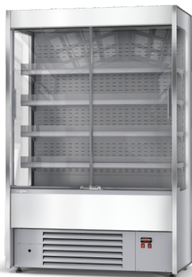
Glazed multideck refrigerated display RCh-SR/133