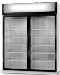
cm w. 120 / 140 / 160 d. 75 / h. 202