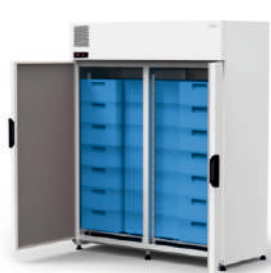
model 21-E2 ecoline / standard cm w. 160 / d. 80 / h. 202