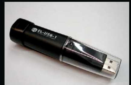
USB temperature recorder - wireless