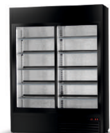
model SR/WH/BP cm w. 120 / 140 / 160 d. 74,5 / h. 219