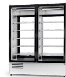
model 2SR ecoline / standard cm w. 120 / 140 / 160 d. 74 / h. 200