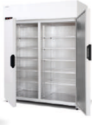
ecoline / standard model ZR/AG cm w. 120 / 140 / 160 d. 74,5 / h. 202