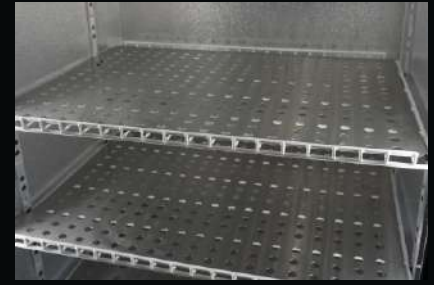
Perforated pad to be applied on standard shelf - made of grinded stainless steel