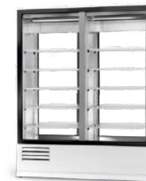
cm w. 120 / 140 / 160 d. 67,5 / h. 198