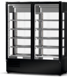
model 4S/NW/W/BP cm w. 120 / 140 / 160 d. 72 / h. 200