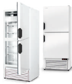
model Z/2D ecoline / standard cm w. 62,5 / 72,5 / 82,5 d. 73 / h. 200