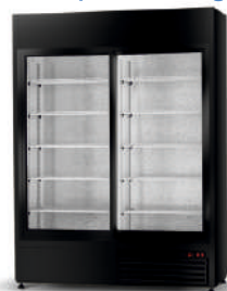
model SR/WH cm w. 120 / 140 / 160 d. 74,5 / h. 219