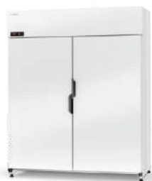
cm w. 120 / 140 / 160 d. 73 / h. 202