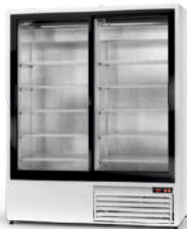
model SR ecoline / standard cm w. 120 / 140 / 160 d. 74,5 / h. 198