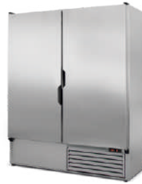
Z/NZ model R-290 / ecoline / standard exterior made of grinded stainless steel