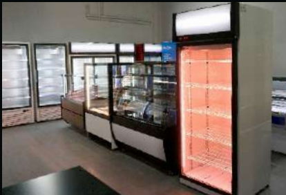
LED lighting - meat