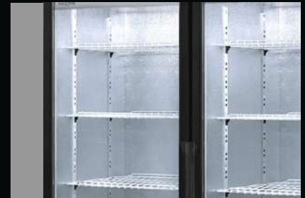
LED lighting - cold