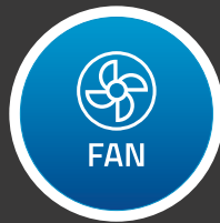
Fan assisted cooling