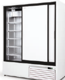
model ZR ecoline / standard cm w. 120 / 140 / 160 d. 74,5 / h. 198