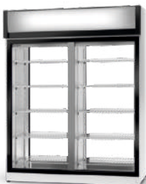
model 2SR/AG/1D ecoline / standard cm w. 120 / 140 / 160 d. 78 / h. 202