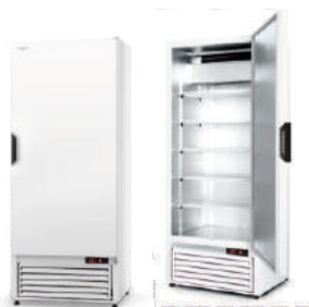
models Z ecoline / standard cm w. 62,5 / 72,5 / 82,5 d. 73 / h. 200