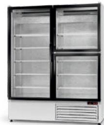
model S/3D ecoline / standard cm w. 120 / 140 / 160 d. 72 / h. 200