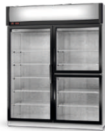
ecoline / standard model S/AG/3D cm w. 120 / 140 / 160 d. 75 / h. 202