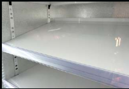
Painted solid shelves - made of steel powder-coated