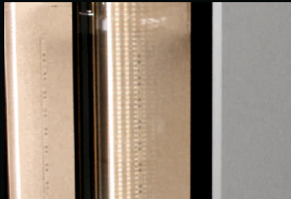
LED lighting - warm