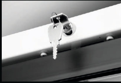
Lock for hinged door - cabinets single-chamber / double-chamber