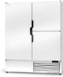
model Z/3D ecoline / standard cm w. 120 / 140 / 160 d. 73 / h. 200