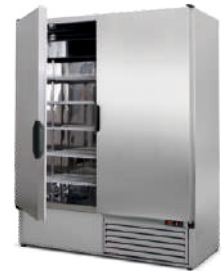
Z/2N model R-290 / ecoline / standard interior made of „mirror” stainless steel exterior made of grinded stainless steel