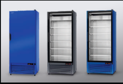
Painting of housing in colour from the RAPA colour chart or individual RAL colour chosen by customer.