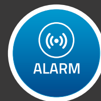
Open door sound alarm