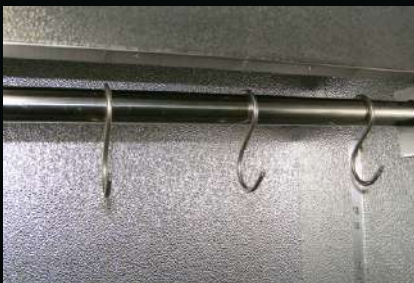
Bar for hooks type S - cabinets single-chamber / double-chamber