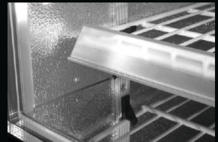
Shelf edge strip - transparent