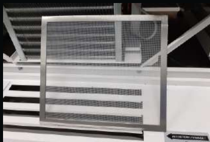
Pollen filter - reusable