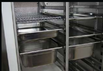
Adaptation of the device for GN containers (1/1, 1/2, 1/3, 2/3) applicable to upright refrigerated cabinets models Z-825 / Z-1600 (without a fan)