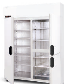
ecoline / standard model Z/AG/3D cm w. 120 / 140 / 160 d. 73 / h. 202