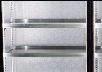
Solid stainless steel shelves