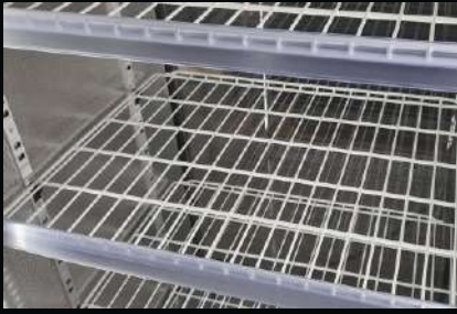
Ribbed plasticised standard shelves - white