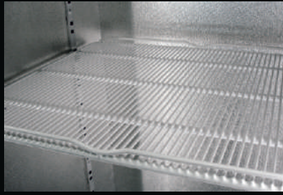
Ribbed plasticised dense shelves - white