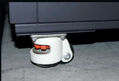
Set of 4 wheels with regulated foot -applicable to double-chamber upright refrigerated cabinets