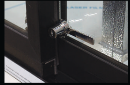
Lock for sliding door