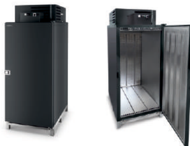
model CARGO mm w. 780 / d. 1190 / h. 1340 / 2000

The Cargo cabinet was developed with the food, pharmaceutical and medical industries in mind.