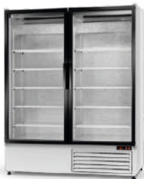
cm w. 120 / 140 / 160 d. 72 / h. 200