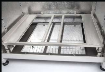
Basis for EURO 2 containers - applicable to cabinets of the widths of 825 mm and 1600 mm