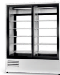
model 2S2R ecoline / standard cm w. 120 / 140 / 160 d. 76 / h. 198