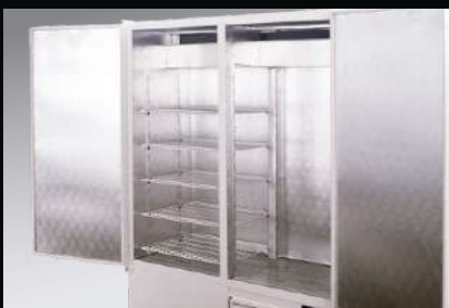
Interior of double-chamber upright cabinet without partition