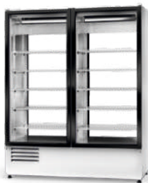
cm w. 120 / 140 / 160 d. 72 / h. 200