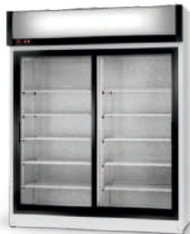
ecoline / standard model SR/AG cm w. 120 / 140 / 160 d. 79 / h. 202