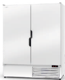
cm w. 120 / 140 / 160 d. 73 / h. 200