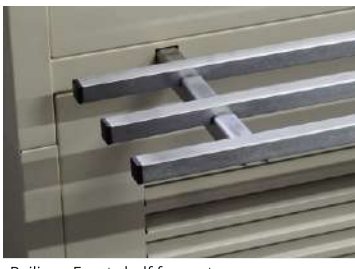
Railing - Front shelf for customer Additional equipment