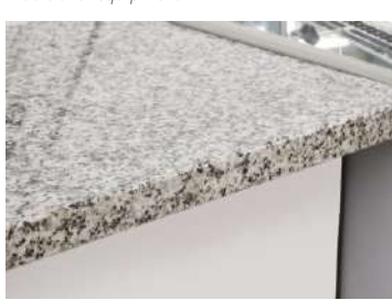
Granite worktop Additional equipment